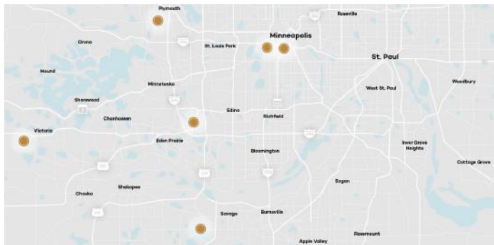
Current Wooddale Microchurches

Our vision is to launch dozens of microchurches around the region in the next three years, resulting in many new believers and more microchurches. For those being called to lead a microchurch, a training center will be launching in 2022 to train and equip you in following God's call to reach your community with the Gospel.