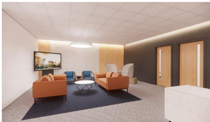
Family Resource Initiative Office

To continue supporting the growing ministries of Wooddale Church, we will be updating the following spaces at the Eden Prairie campus: