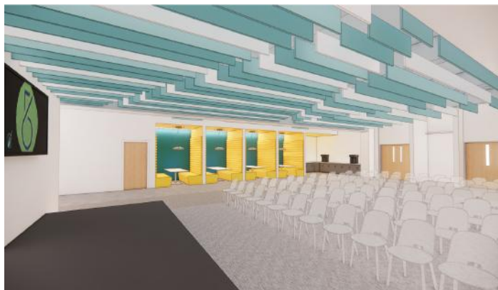
5-6 Grade Room Renovation