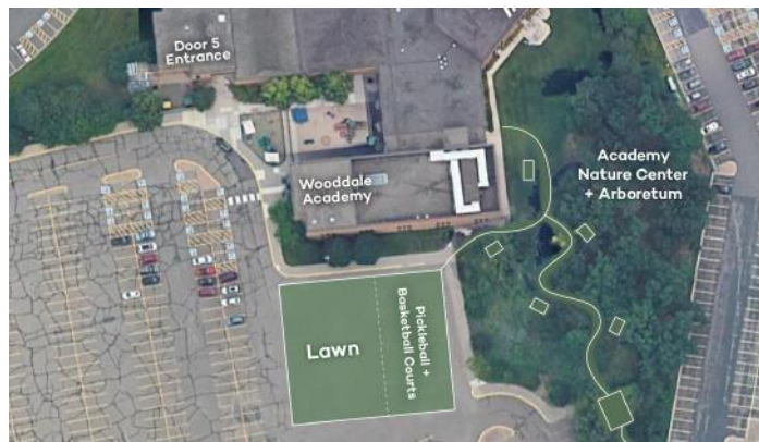
Outdoor Space Enhancements

We will also be making updates at our Edina and Loring Park campuses for Next Gen (student) ministries.