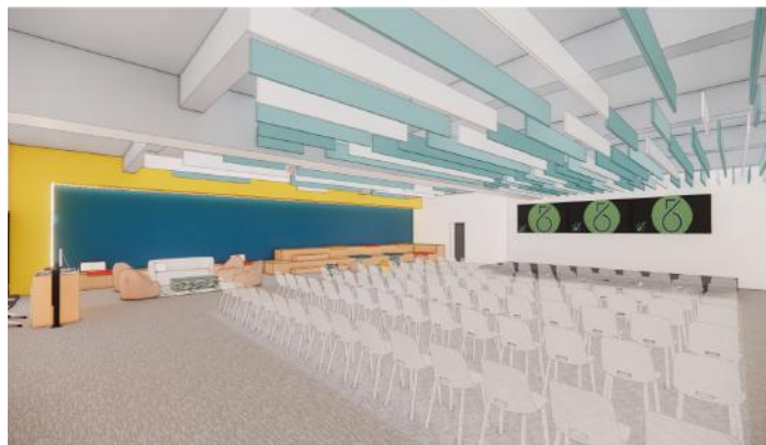
5-6 Grade Room Renovation