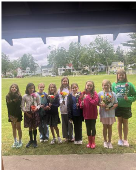
Chippies made flower arrangements on Thursday, June 26th!

Thank you for your support as we work to maintain great experiences for everyone this summer.