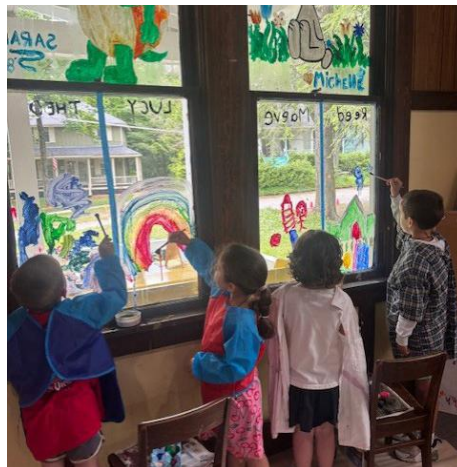
Fawns enjoying the annual Fawn House Window Painting.

Summer is in full swing at Bay View Association. Our first week at the club was a great success, with online registration running smoothly.