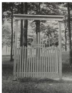
Original Gates of Knowledge (1897).