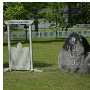
BVRC Rock and Replica of the Gates of Knowledge (2025).