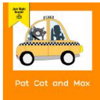
Pat, Cat and Max

More reading and writing fun at JustRightReader.com!