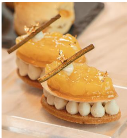
Festive Afternoon Tea (Includes Dilmah Tea or Illy Coffee)

Celebrate the season in style with Sofitel Kuala Lumpur Damansara's Christmas Afternoon Tea. From handcrafted holiday treats to sparkling moments of joy, indulge in an elegant yuletide experience that captures the true spirit of Noël.