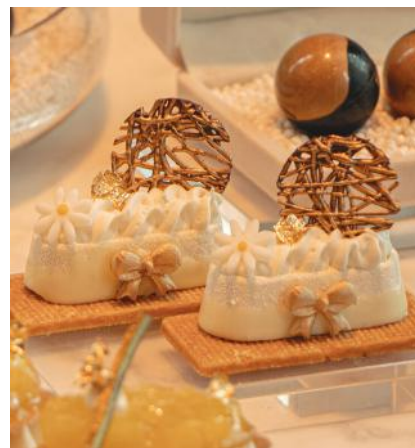
Christmas Champagne Afternoon Tea (Free flow Dilmah Teas or Illy coffee and 1 glass of Champagne or 1 Mug of Muled Wine)

From 1 - 31 December 2025 2.00 p.m. - 5.00 p.m. RM 168+ (For Two Persons)