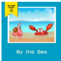
By the Sea