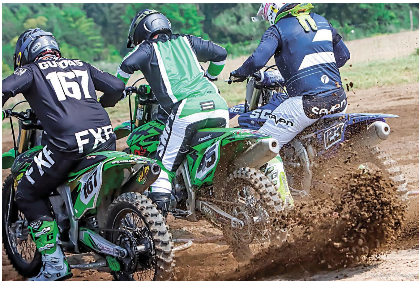
▲ Twisted MX - Milan, MI