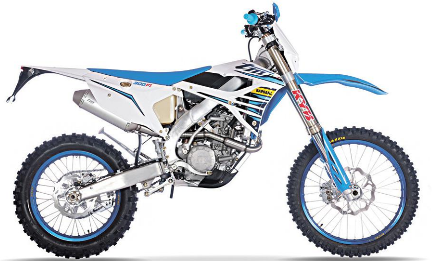
▲ Flat across the top

TM continues to offer the 2T MX and EN (enduro) line-ups with a tried-and-true Keihin carb.