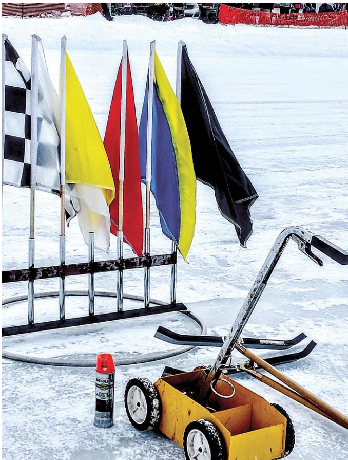
▲ Big Bend Family Campground – Standish, MI