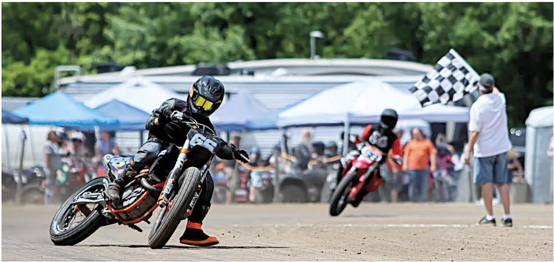
▲ Polka Dots Motorcycle Club – Midland, MI