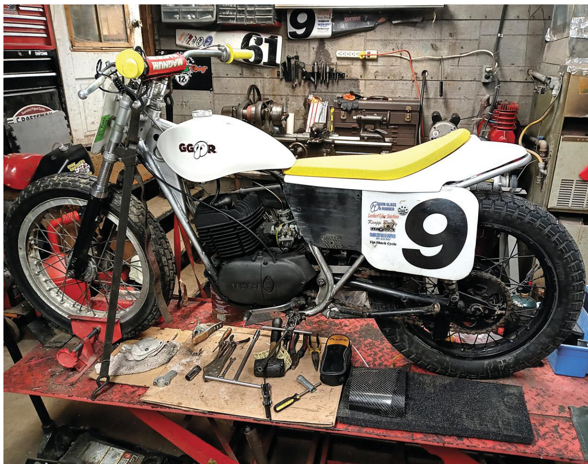
The bike was a nice shade of Purple when it came into Goon Glass & Rubber World Headquarters.

Going full on hack and wack' I took the ol' Chicago Electric cut off wheel to town on unneeded tabs and hardware as well as a sub-frame hoop. Once I removed all this uselessness, I drove over to Tin Shack Cycle to have Shawn bend up a subframe whoop I was gonna bird poop weld onto the frame... and yes, it was bird poop... after a box of jackrod and a few hours on a grinder, I knew what would make this build pop... and cover my snot shot weld/grind job... a can of silver metallic paint; and I did the whole frame too!