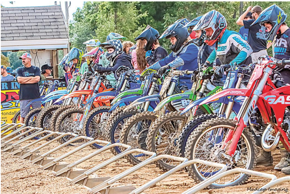
▲ Log Road - Buchanan, MI