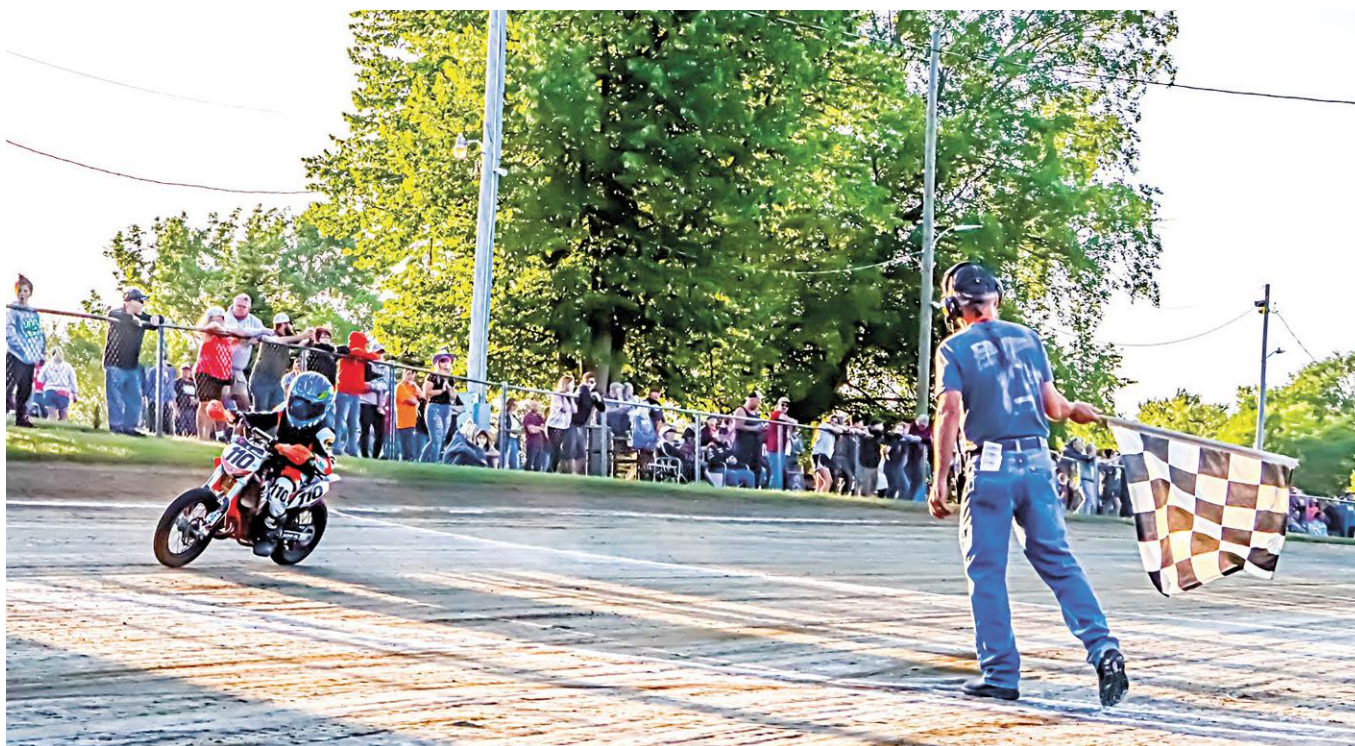
▲ Lucky Thumb Motorcycle Club – Deford, MI