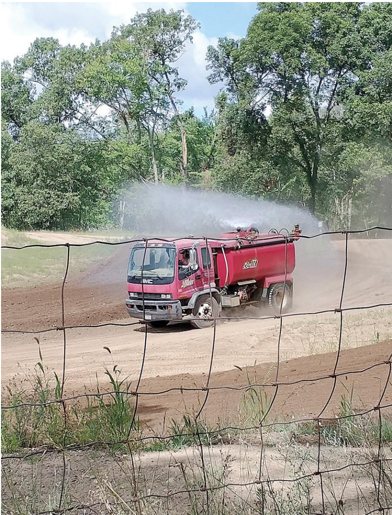
▲ Log Road – Buchanan, MI

cations, their birthdays, even medical concerns because that track and being there for those kids is the most important thing to them. It's their life, what they love, and what they want to pass on! Most of the workers are either family members of riders who are missing their children's race so they can run yours, or past riders who still crave the track, who just want to be involved with what they have loved their whole lives. When you retire as a racer what do you do when you're just not done yet? You pass on your knowledge!! You coach the littles!! You help with the track!!