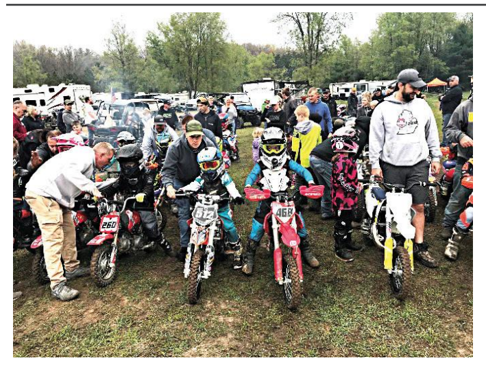
▲ 50cc Auto start