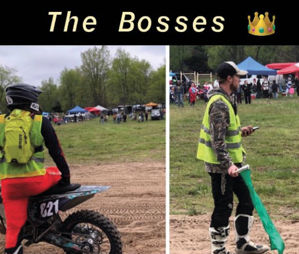
Got everything under control!!