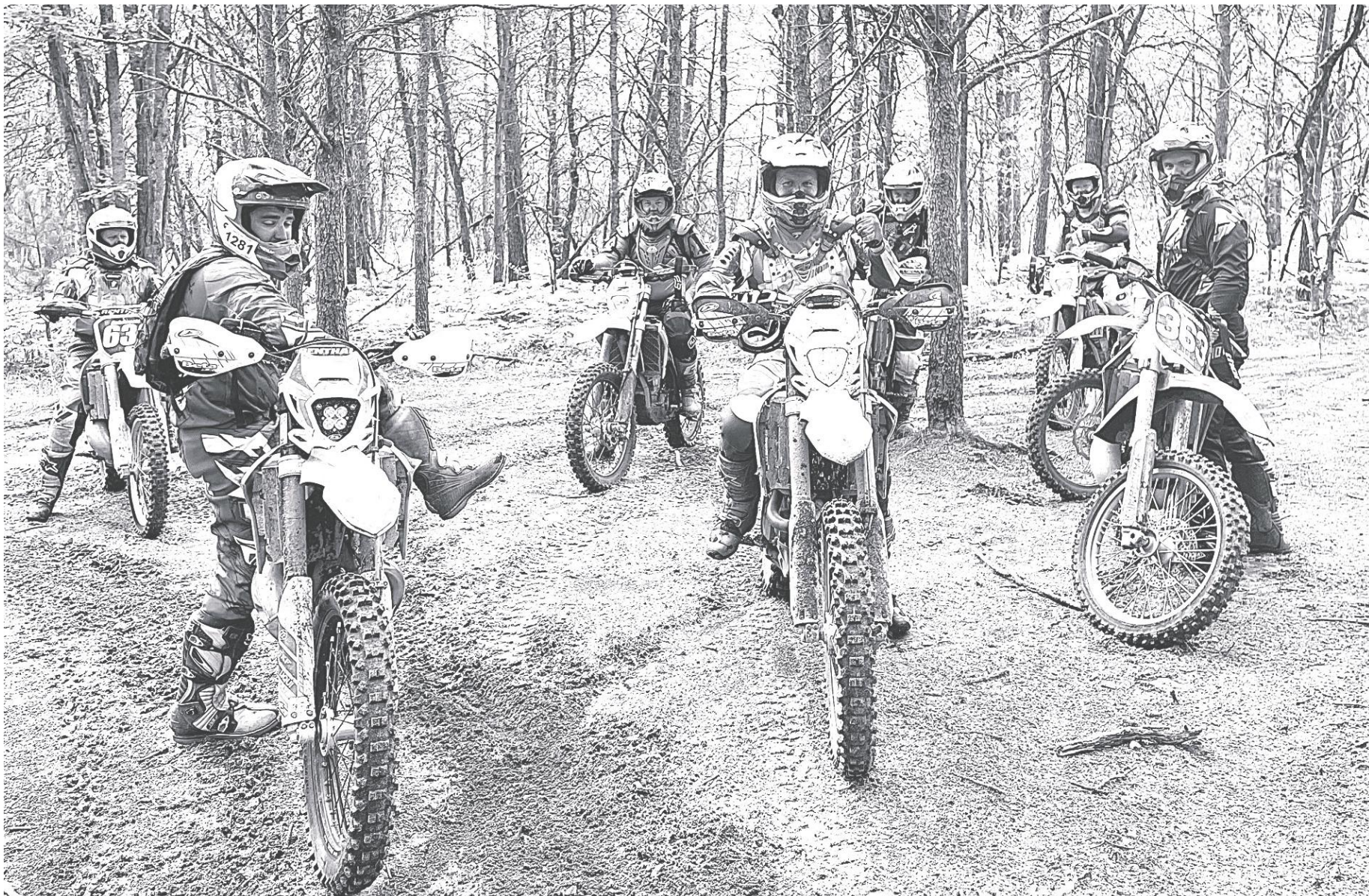
▲ Soggy Bottom Boys