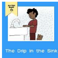
The Drip in the Sink

More reading and writing fun at JustRightReader.com!