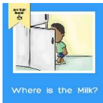
Where is the Milk?