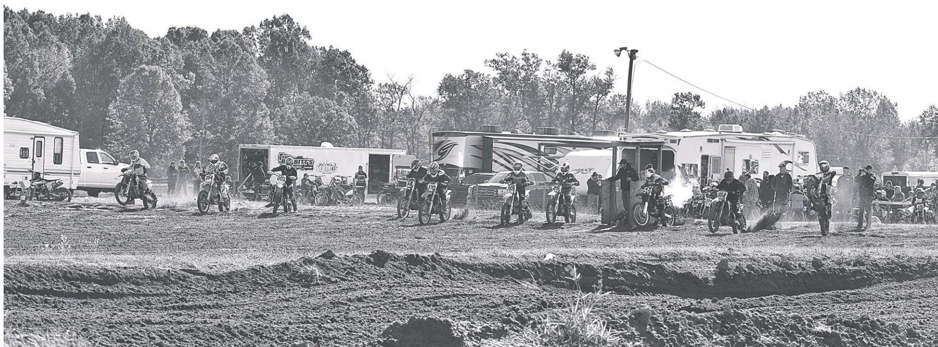
▲ First ever gate drop on the 65/70+ money moto