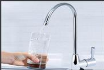
Filtered Tap Water