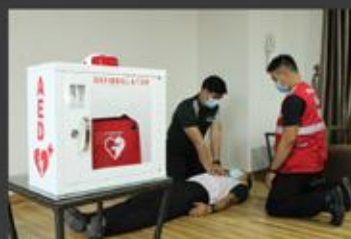
Defibrillator & Trained Staff

Experience the distinctions of La Grande Residence. Call +63 922 375 8679 or email us at reservations@lagranderesidence.com for your inquiries and reservations requirements