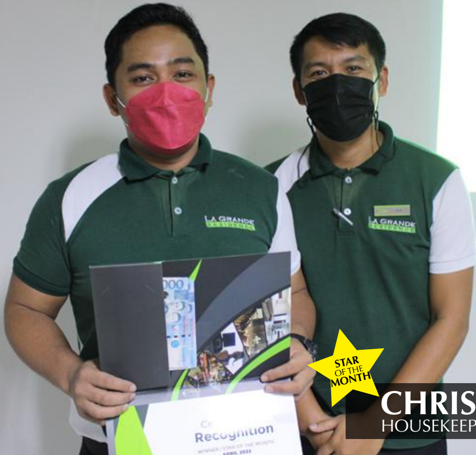
CHRISTIAN HOUSEKEEPING DEPT