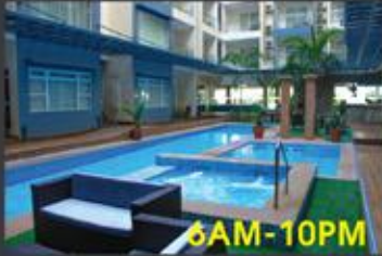
Ground Floor Heated Jacuzzi