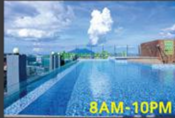
Infinity Pool & Jacuzzi