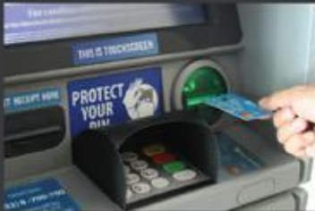
ATM (Metro Bank)