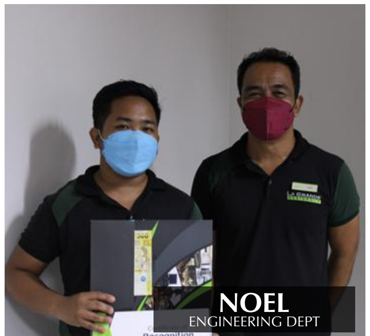
NOEL ENGINEERING DEPT