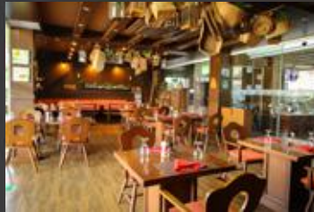
Zermatt Restaurant & Bakery