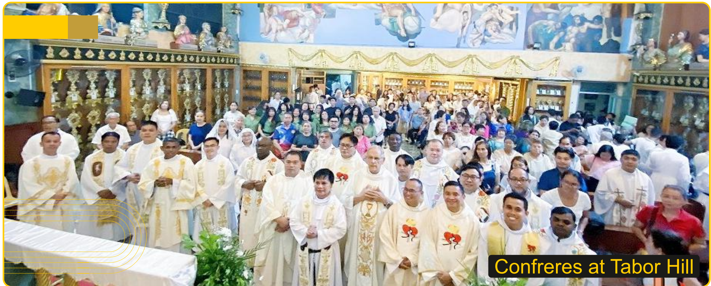
Confreres at Tabor Hill

Divine steps have been taken and many more are yet to come to live out our charism, “Joyfully serving the Most High in spirit of humility.”