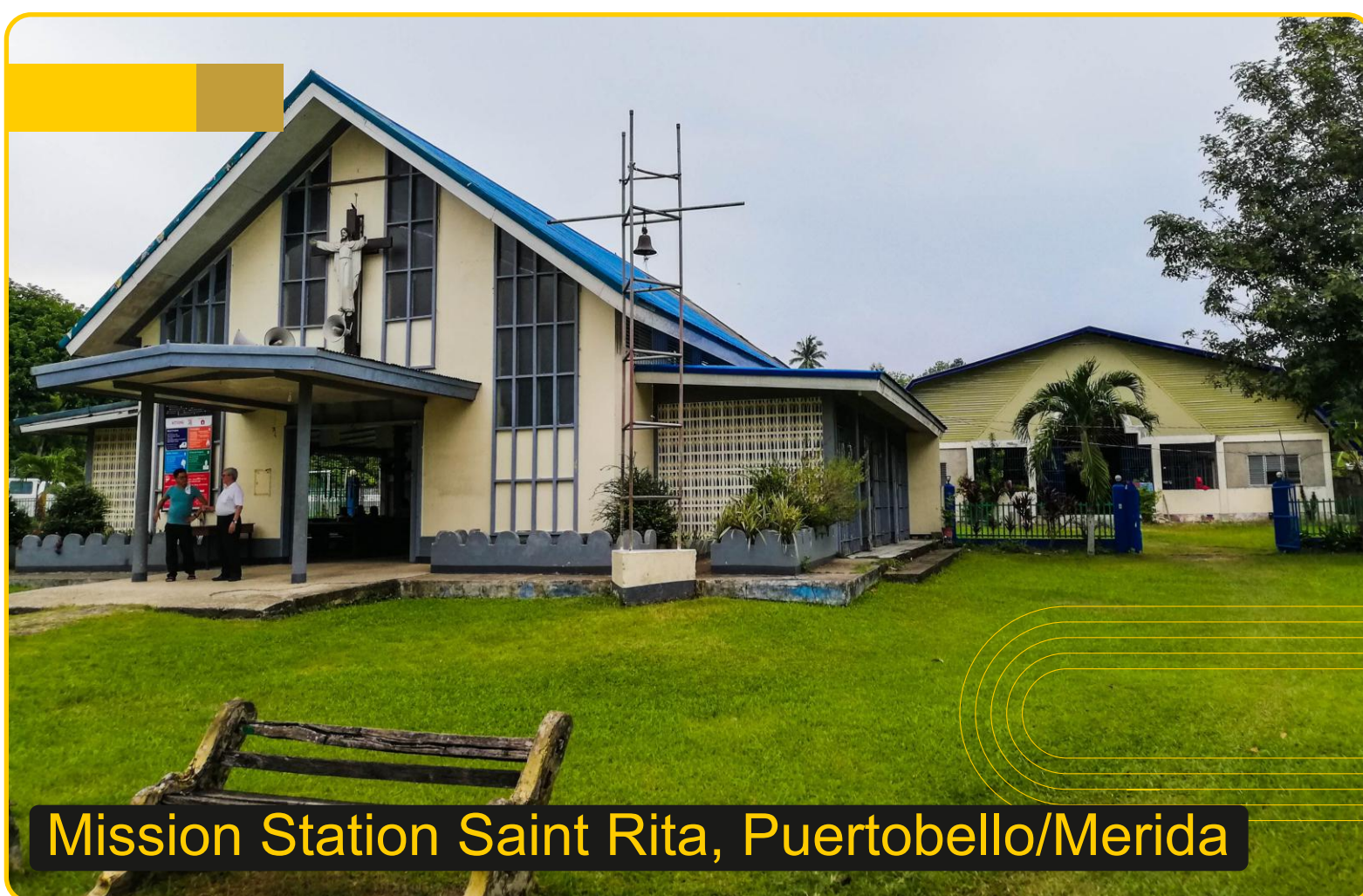
Mission Station Saint Rita, Puertobello/Merida

Philosophy and Religious Studies. This expansion has allowed us to train not only future religious leaders, but also lay people seeking a quality education rooted in Augustinian values.