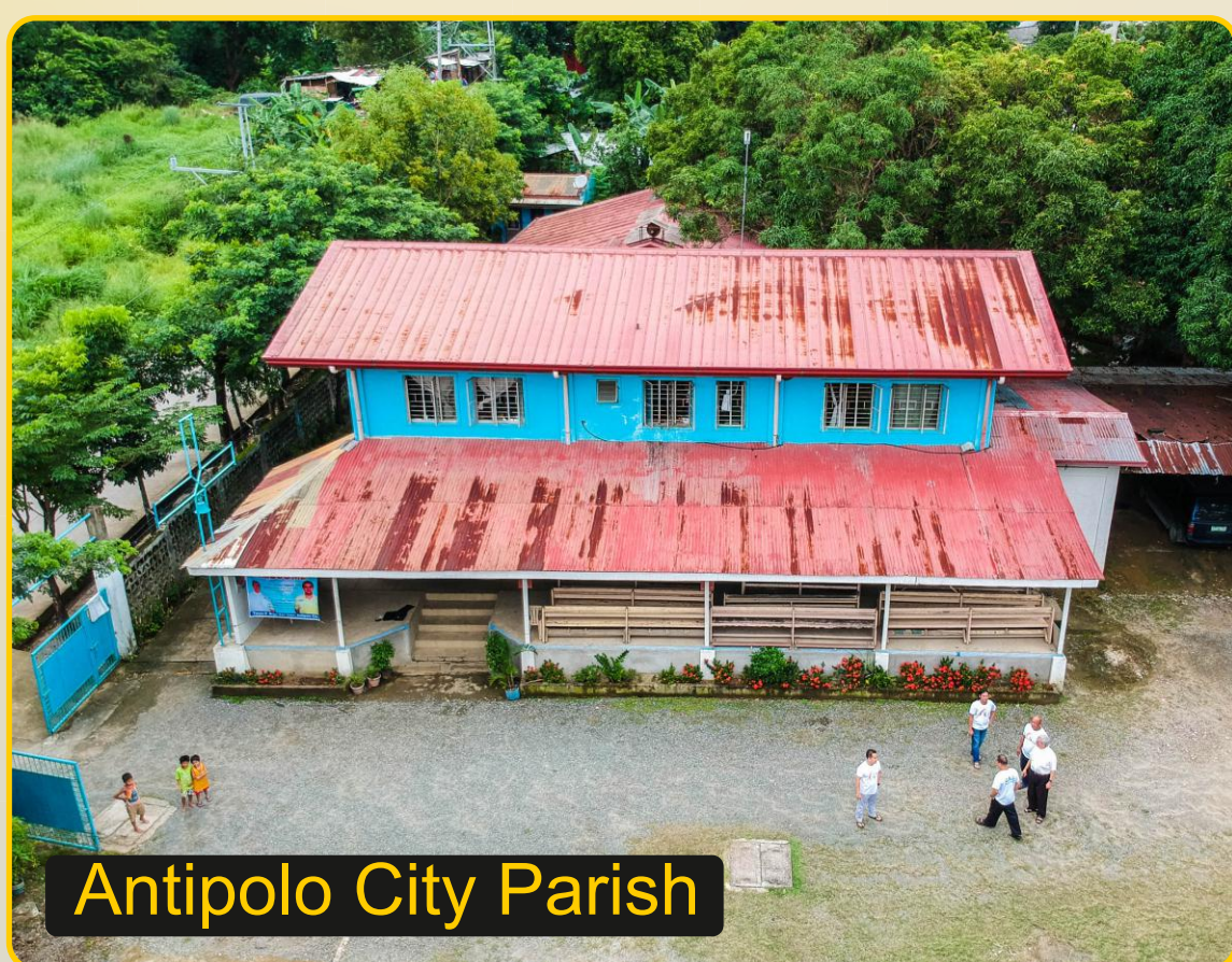
Antipolo City Parish

The priestly ordination of the first Filipino brothers was an event of great significance for our presence in Asia. This milestone represented the first fruits of years of dedication to spiritual and cultural formation, a sign that the Discalced Augustinian charism had been received with depth and enthusiasm in the Philippines.