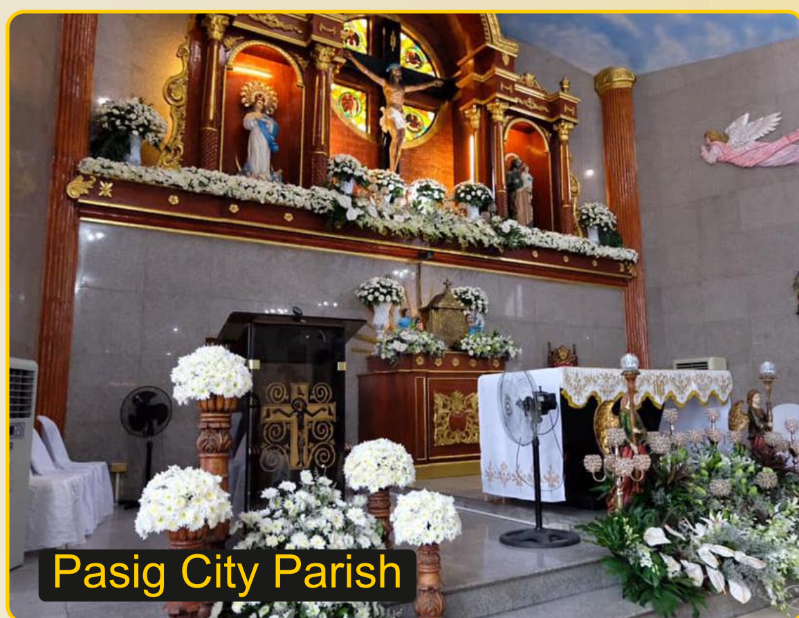
Pasig City Parish