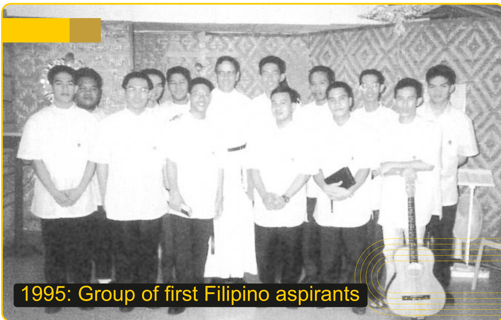
1995: Group of first Filipino aspirants