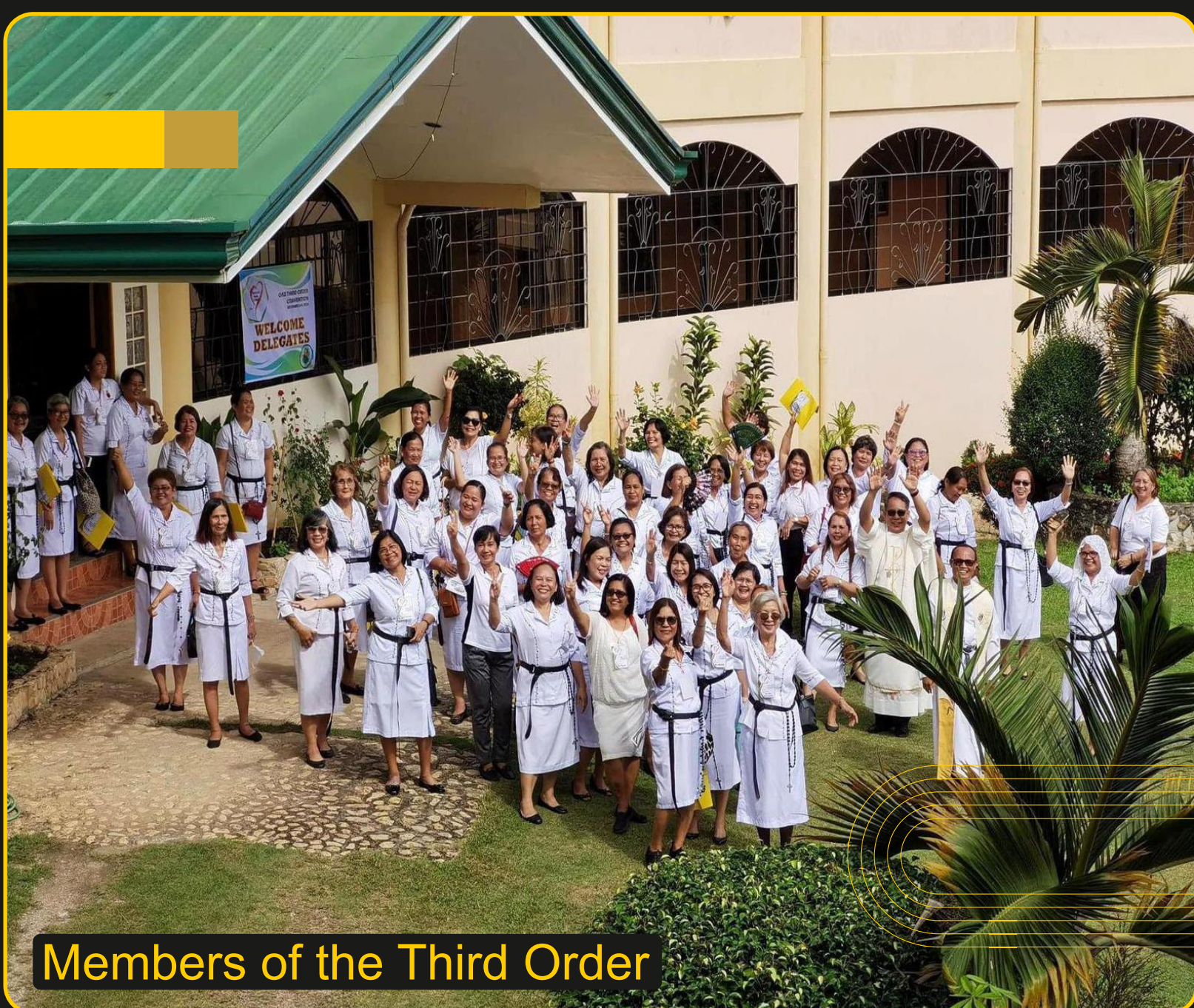
Members of the Third Order

In addition, some members are actively engaged in various ministries within their local churches, contributing to the life of the larger church community.