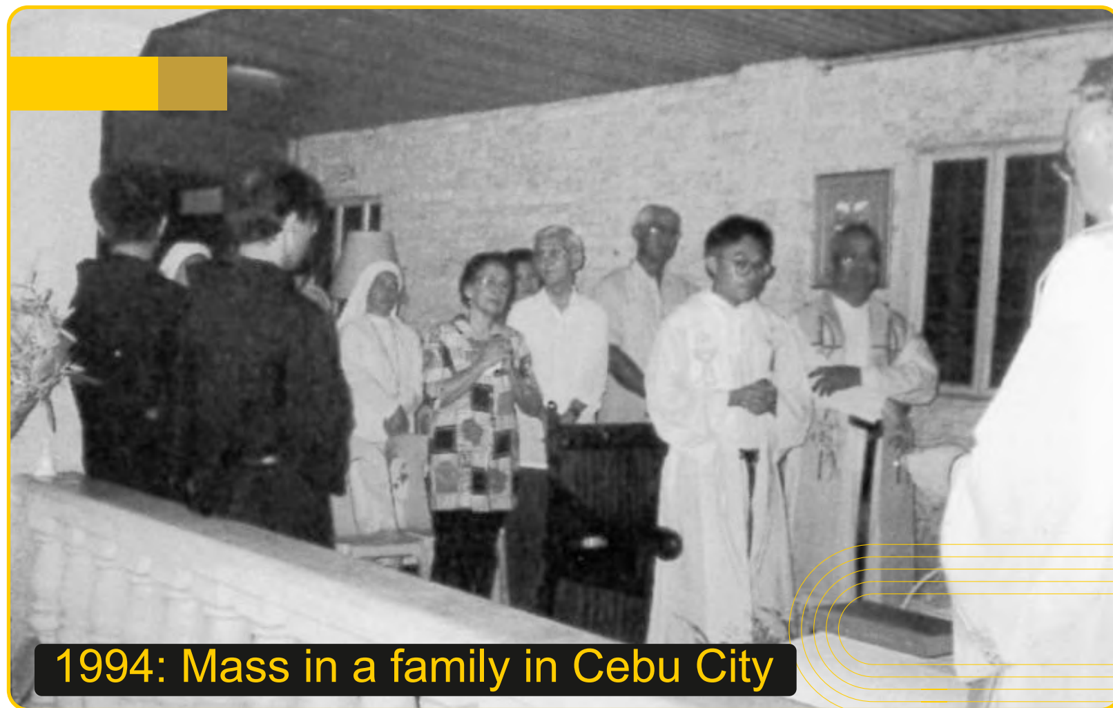
1994: Mass in a family in Cebu City

The year 2024 marks a significant milestone for the Order of Discalced Augustinians as it celebrates 30 years of service to the people of the Philippines and other countries in Asia. Since its arrival in the Philippines, our Order has been steadfast in its mission to “ bring God closer to the people and bring the people closer to God. ” Guided by our charism, which emphasizes the joy of serving the Most High in a spirit of humility, we have grown in various apostolates, extending God's love and compassion to those we serve.